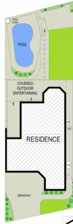
APPROX. INT: 214m 2