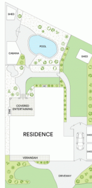
Glen Alpine Drive